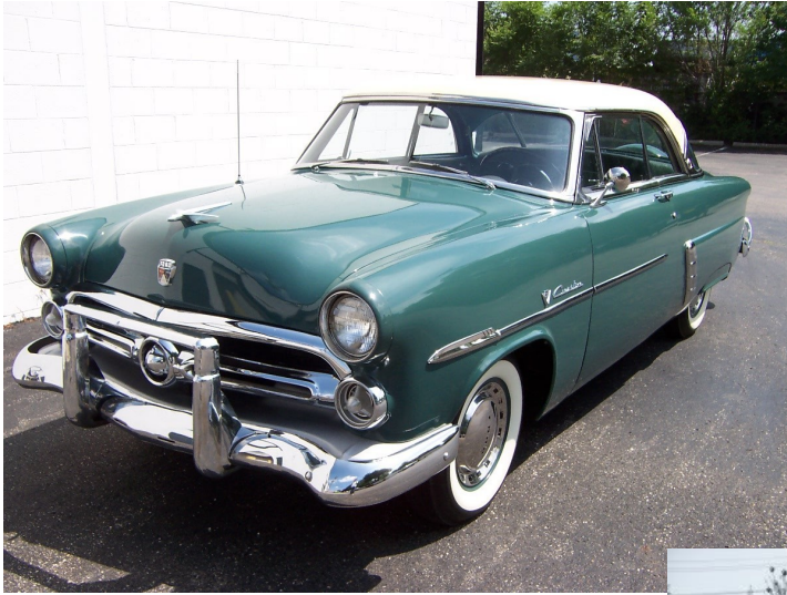
Terry Brim 52 Ford